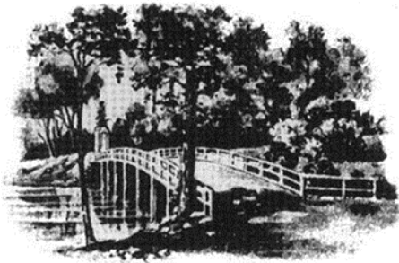
OLD NORTH BRIDGE

TOWN OF CONCORD TOWN HOUSE - P.O. BOX 535 CONCORD, MASSACHUSETTS 01742